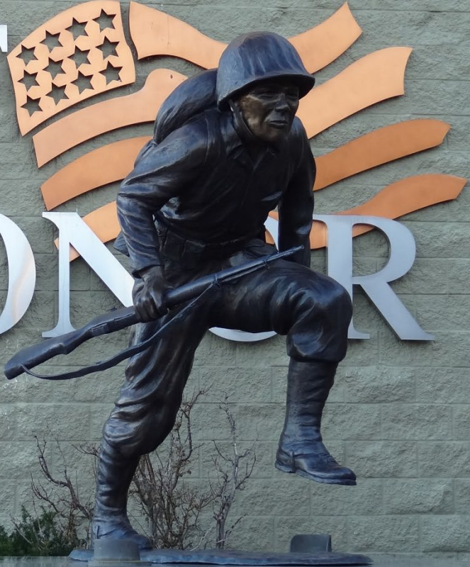
"UNDER FIRE" The bronze statue of a Marine in combat, known as "Under Fire," is a tribute to the courage and sacrifice of the Marines who served in Vietnam. It was created by artist Fritz Koenig and is located at the Marine Corps Air Station in Miramar, California.