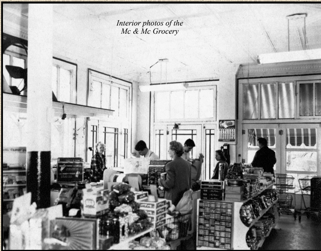
Interior photos of the Mc & Mc Grocery