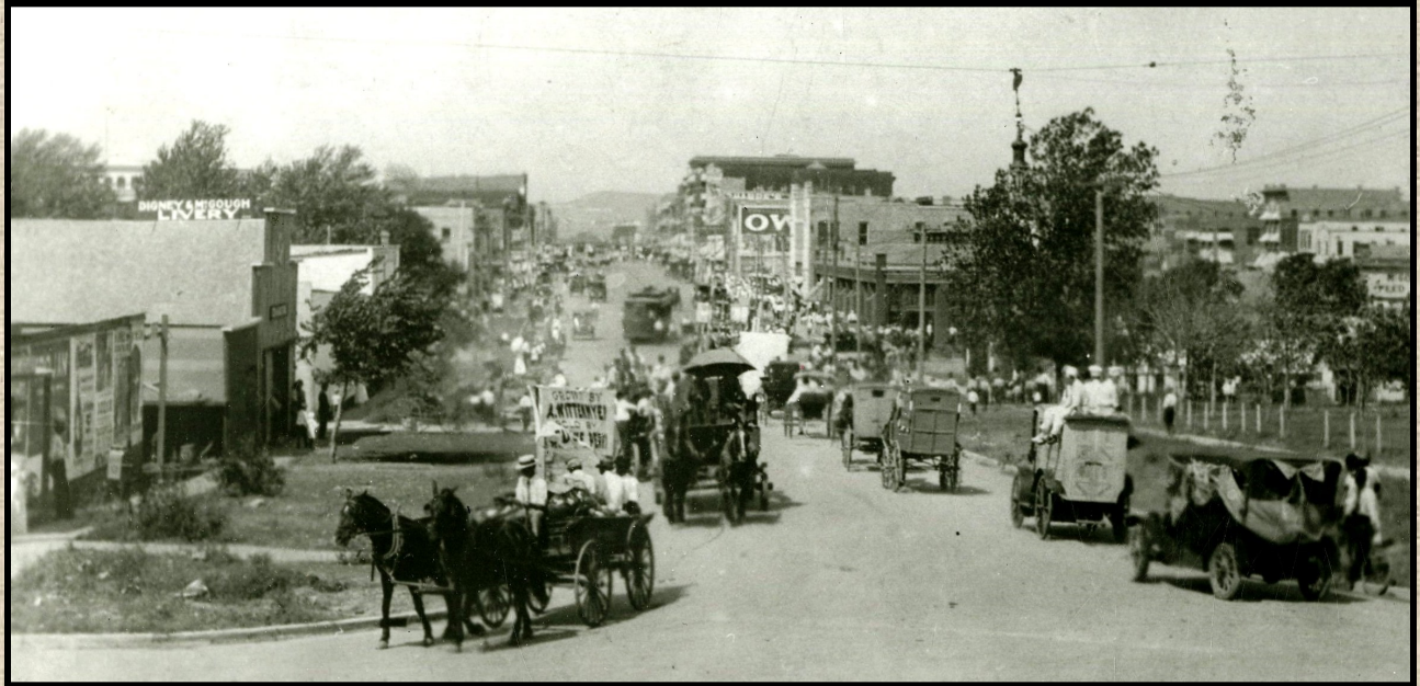
Early Bartlesville about 1913-14 showing the Digney & McGough Livery at 413 E. Third Street with dirt streets, horses, buggies and the Bartlesville Interurban Railroad