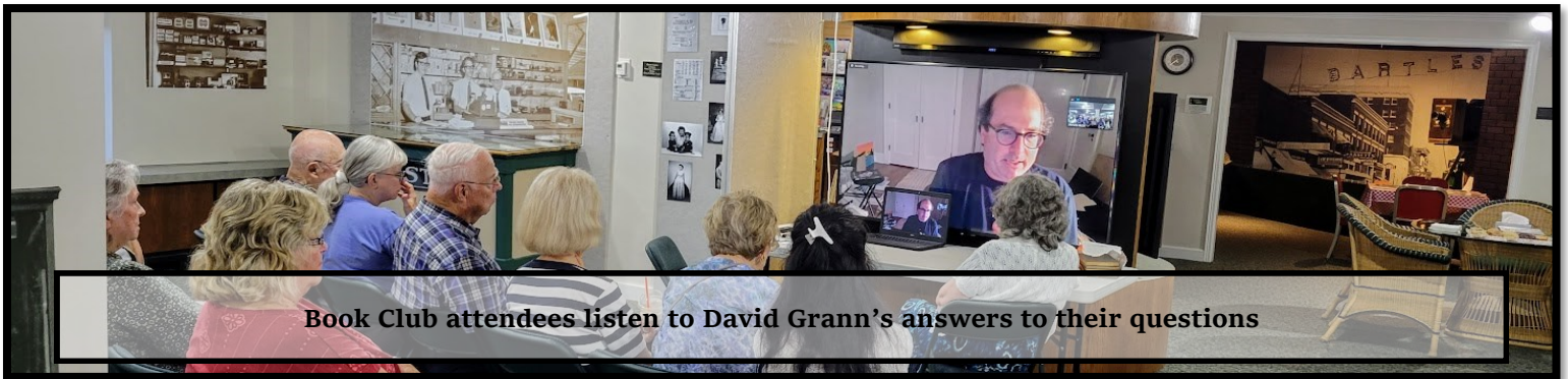
Book Club attendees listen to David Grann's answers to their questions

It's not just events that have kept us busy. The Museum has hosted over 1220 visitors so far this year! We have enjoyed meeting so many new people and seeing so many familiar faces.