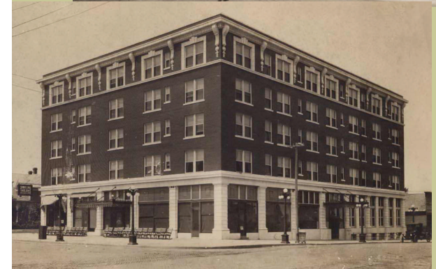
Maire Hotel, Drum Studio, pre 1916.